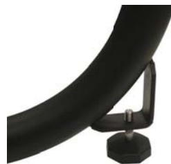
Additional pole-support foot