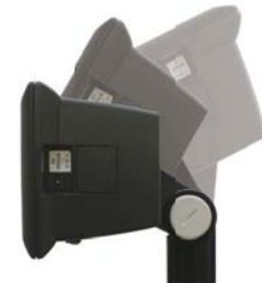
Tilting indicator bracket