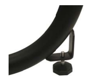
Additional pole-support foot