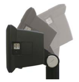
Tilting indicator bracket