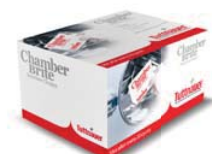
Chamber Brite Autoclave Cleaner