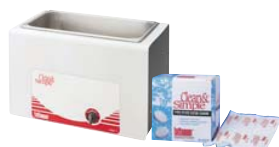
Clean & Simple™ Ultrasonic Cleaners and Tablets

Documents: date, time, temperature, pressure.