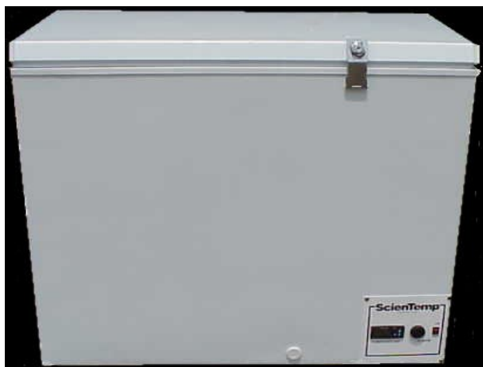
Standard 7 cu ft Freezer