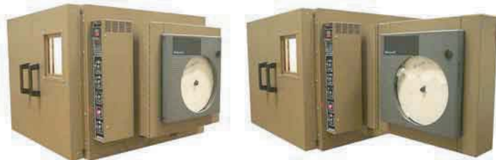
MODEL 21-350ER shown with optional window and chamber light & 10" "swing-out" circular chart recorder