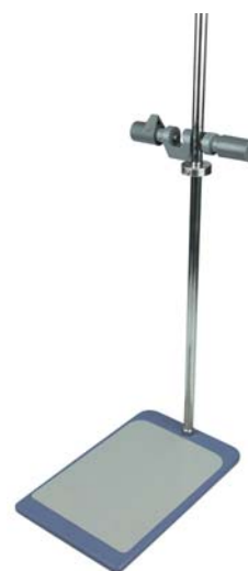
18900131 Plate stand