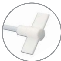
18900076 Straight impeller, PTFE-coated