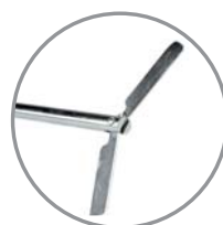
18900074 Centrifugal impeller, 316L stainless steel