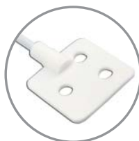
18900077 Paddle impeller, PTFE-coated