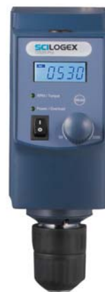
OS40-Pro / OS20-Pro