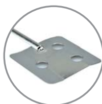
18900073 Paddle impeller, 316L stainless steel