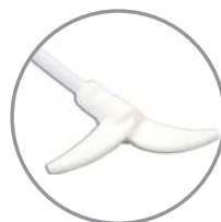
18900078 Centrifugal impeller, PTFE-coated