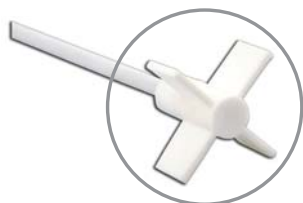
18900075 Cross impeller, PTFE-coated