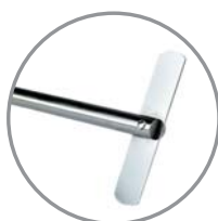
18900072 Straight impeller, 316L stainless steel