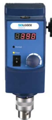
OS40-S / OS20-S