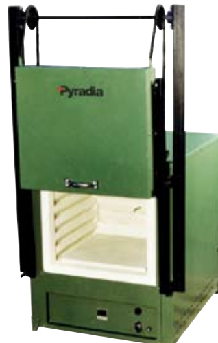
Enamel coated steel casing, with optional vertical opening door