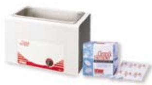
Clean&Simple™ Ultrasonic Cleaners and Tablets

Documents: date, time, temperature, pressure.