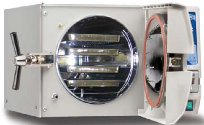
EZ10 with 4 large trays

* Above photo shown with optional printer