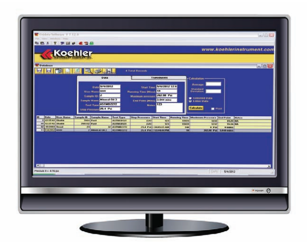
Advanced Communications Software Package for Data Management