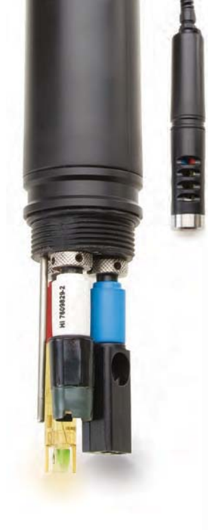
HI 7609829 pH/ORP, Dissolved Oxygen, EC