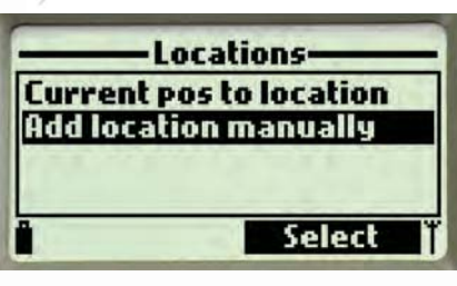
GPS data can be customized to meet specific requirements.