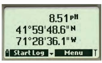
Display current readings along with GPS coordinates