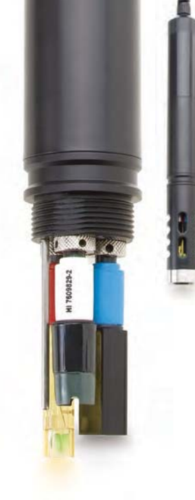
HI 7629829 pH/ORP, Dissolved Oxygen, EC, Logging