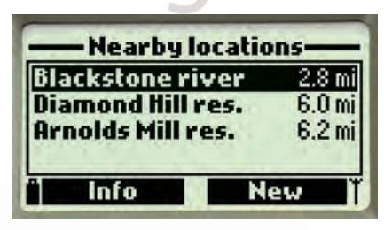
Displays distances between current location and predefined locations.