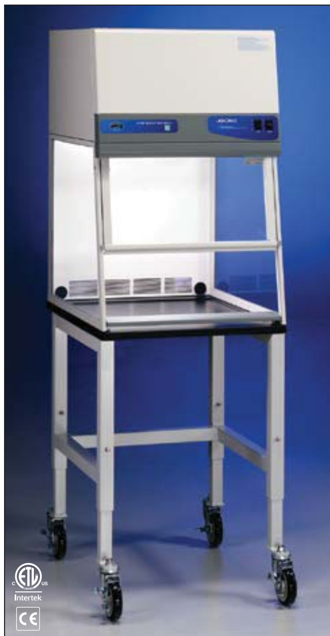
Purifier Vertical Clean Bench 3970200 on Solid Epoxy Dished Work Surface 3909900 and Telescoping Base Stand 3746710.