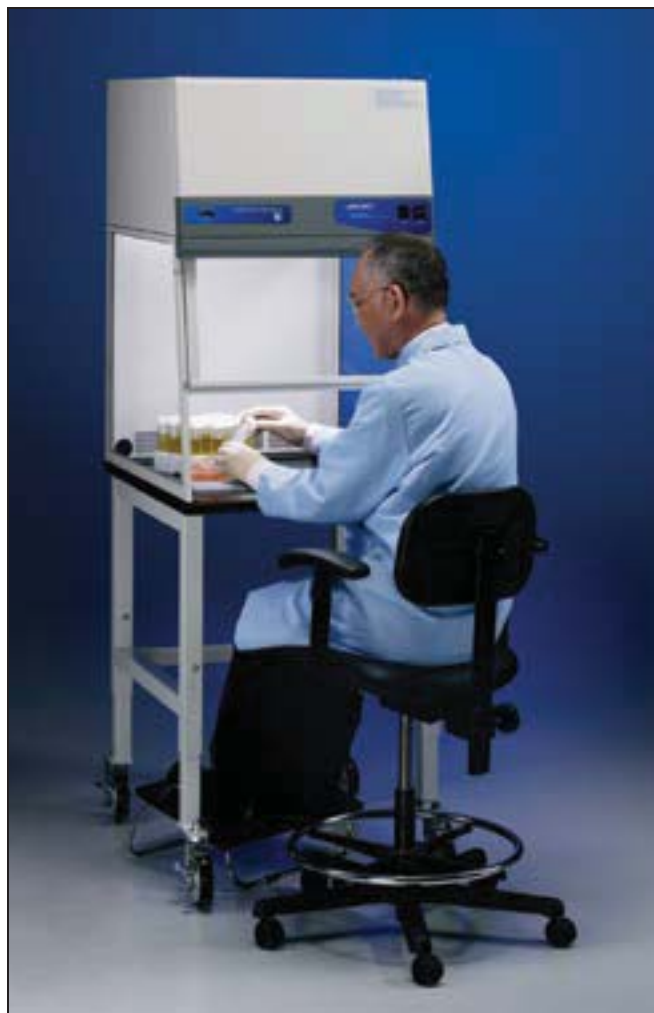
Purifier Vertical Clean Bench 3970200 on Solid Epoxy Dished Work Surface 3909900 and Telescoping Base Stand 3746710 with Ergonomic Chair 3744000 and Adjustable Footrest 3746000.

Purifier Vertical Clean Benches are offered in 2', 3' and 4' widths. Built-in options include a UV light with timer for secondary decontamination and a Guardian Airflow Monitor to monitor downflow velocity and HEPA filter loading.