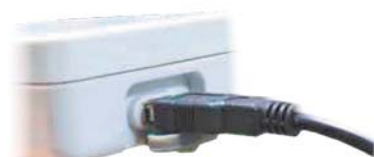
USB Data Output & Power Supply