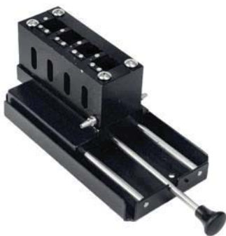
Cat. No. 18900336 10mm water-jacketed 4-cell holder (for SP-V1100 & SP-UV1100)