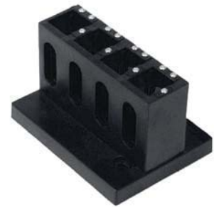
Cat. No. 18900331 4-cell holder for 10mm sq. cuvette