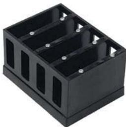
Cat. No. 18900332 4-cell holder for 10mm to 50mm sq. cuvette