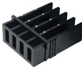
Cat. No. 18900333 4-cell holder for up to 100mm sq. cuvette