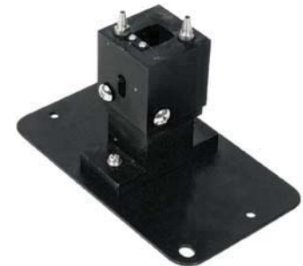
Cat. No. 18900335 10mm water-jacketed 1 cell holder (for SP-V1100 & SP-UV1100)