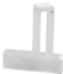
Square cuvettes glass/quartz 1-5mm/10-100mm