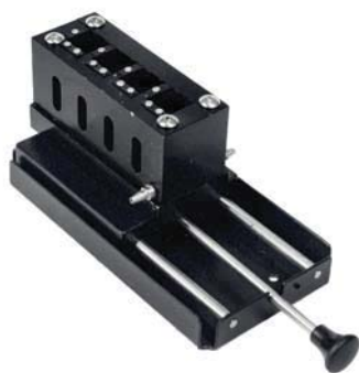
Cat. No. 18900336 10mm water-jacketed 4-cell holder (for SP-V1100 & SP-UV1100)