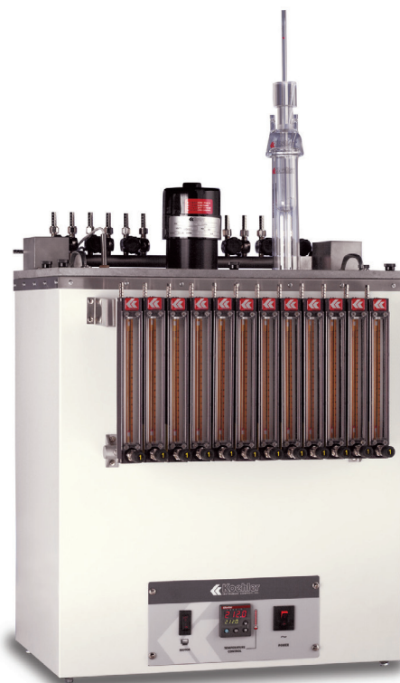
K12219 12-Place Oxidation Stability Bath