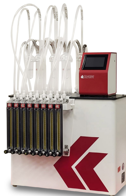
K64200 8-Place Oxidation Stability Precision Bath