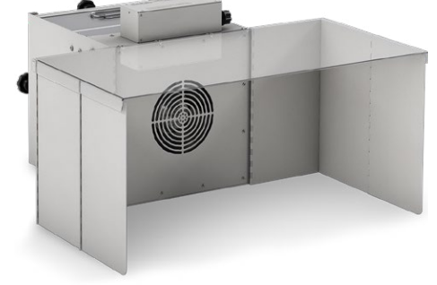
Model 300 Winged Sentry with Lid