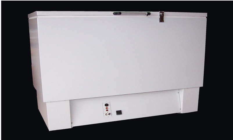
Standard 9.4 cu. ft. Freezer