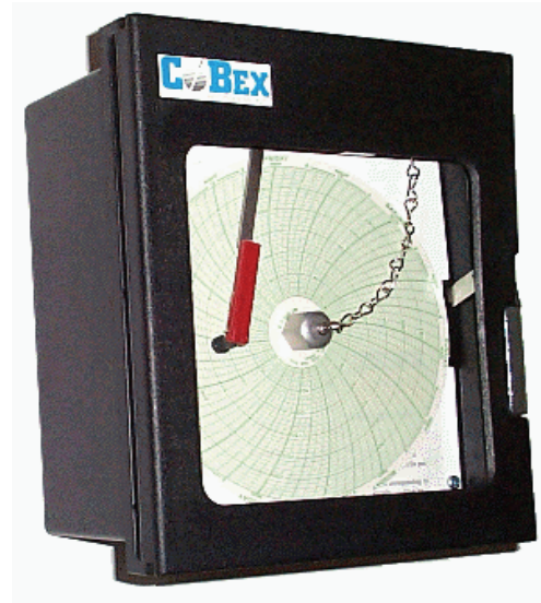
6 inch, Single Pen, Chart Recorder for all models (except 1.0 cu ft)

These recorders are highly versatile and well suited for the recording and monitoring of the temperature inside the freezer. Reliability and precision assure accurate results.